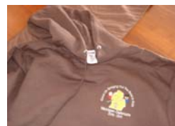
Jerzee Hoodie in Brown (runs small) S, M, L, XL $20

Linda Brooks will have a supply table in the EXPO area loaded with great Optimist merchandise for you to purchase. We have a few of the shirts below left, but you can order one, to assure that you get the shirt you want in your size. Please e-mail her the shirt, color and size you would like to order by August 1 at lybb_1999@yahoo.com . You will be able to pick your shirt up at our Fourth Quarter Convention in Grand Rapids.