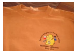
Boxy Crew in Yam/Texas Orange or Smoke (runs big) S, M, L, XL - $24