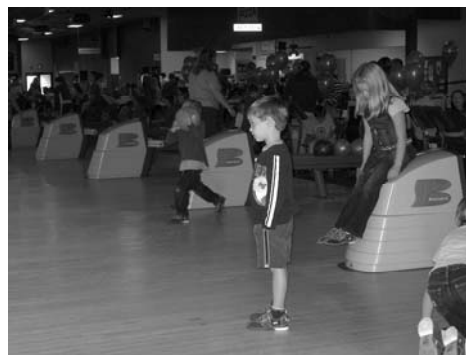
Hope is eternal at the Optimist Bowlathon

If you are interested in learning more about the Traverse City Optimist club, just go to their website, located at http://tc-optimist.org .