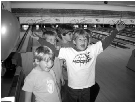
A team of youth enjoy themselves

The Optimist Club provides the venue and the logistics of the bowlathon. The kids' groups and non profit organizations raise money by asking for pledges. All of the money stays in the community. This year Westwoods Elementary PTC, Northern Lights Skating, Young Marines, the Boys and Girls Club of Grand Traverse, the Montessori Childrens House, and others participated in the bowlathon.